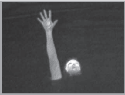
Security in Emergencies