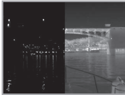
Your Vision vs. FLIR Vision