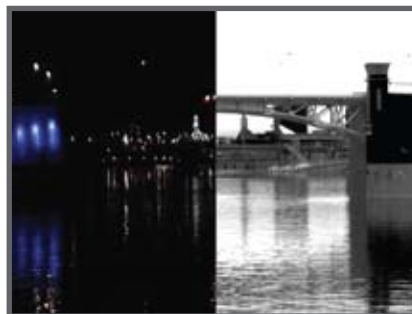
Your Vision vs. FLIR Vision