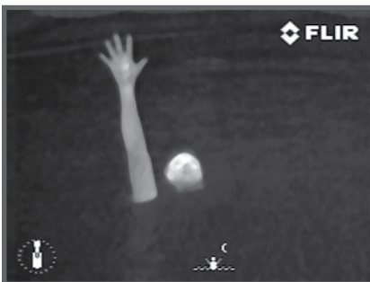
Security in Emergencies