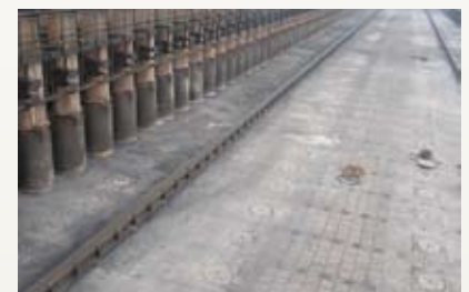
Coke plant furnace

Ladles (picture) are huge containers used in steelworks to transport the molten steel to other production stages. They are covered inside by refractory lining that is needed to withstand molten metal temperatures during the casting process. Refractory materials are heatproof, but also thermal shock-sensitive. Their quality and performance is vital to a clean and safe production process. If they are not exchanged on time, the ladle will burst and tons of 1,500 °C hot liquid steel will gush out into the foundry.