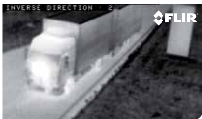
Inverse direction detection