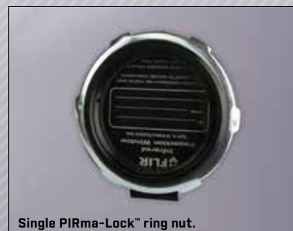
Single PIRma-Lock™ ring nut.