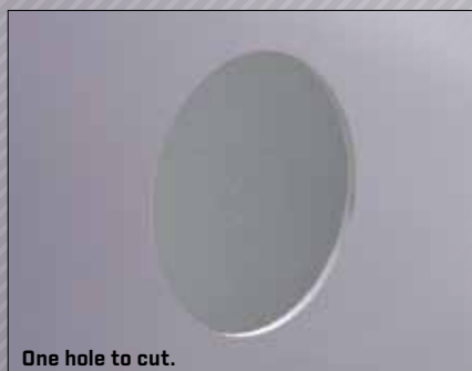
One hole to cut.