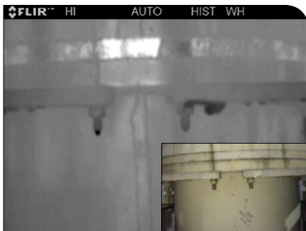
Visible vs. OGI image of SF 6 leak

The US Environmental Protection Agency includes optical gas imaging as an accepted leak detection technique in its Greenhouse Gas Reporting Rule.