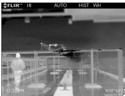
Ammonia (NH 3 ) gas escaping from pipes