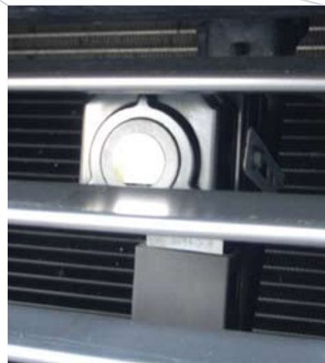
The FLIR Systems PathFindIR installed behind the vehicle grid of a Porsche Cayenne

"Now that it is installed, I use the PathFindIR a lot", continues Xavier. "It allows me to see further than