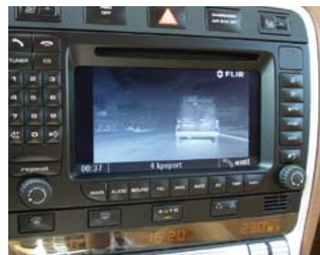
The thermal images generated by the PathFindIR can be displayed on any multi-function LCD display that accepts composite video. In this case on an LCD integrated in the Porsche dashboard.