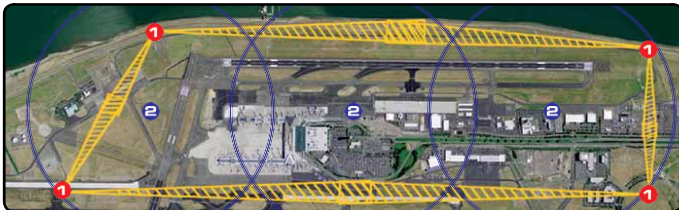
Aerial view of thermal camera layout depicting their fields of coverage and delineating the FLIR Thermal Fence perimeter.