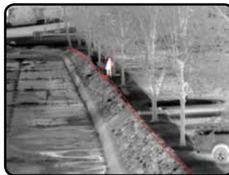
Person approaching video trip wire alarm zone at 350 yards