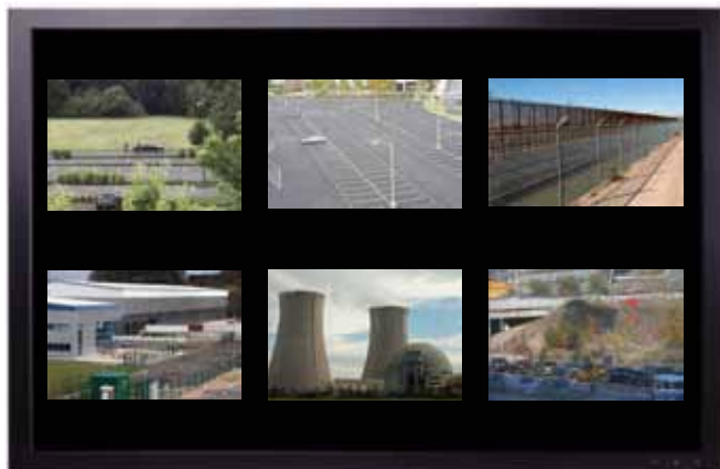
CCTV VIDEO MANAGEMENT SYSTEM