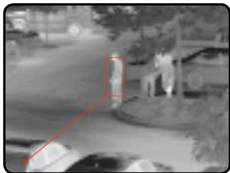
Person in red box detected at 200 yards in total darkness.

FSM's advanced video analytics use algorithms specifically designed to work with thermal video, allowing you to create customized rules for trip wires, exclusion zones, temperature alarms, and directional alarming while providing a much lower rate of false alarms than other analytics packages.