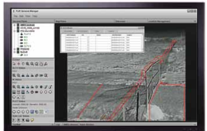
FLIR THERMAL FENCE