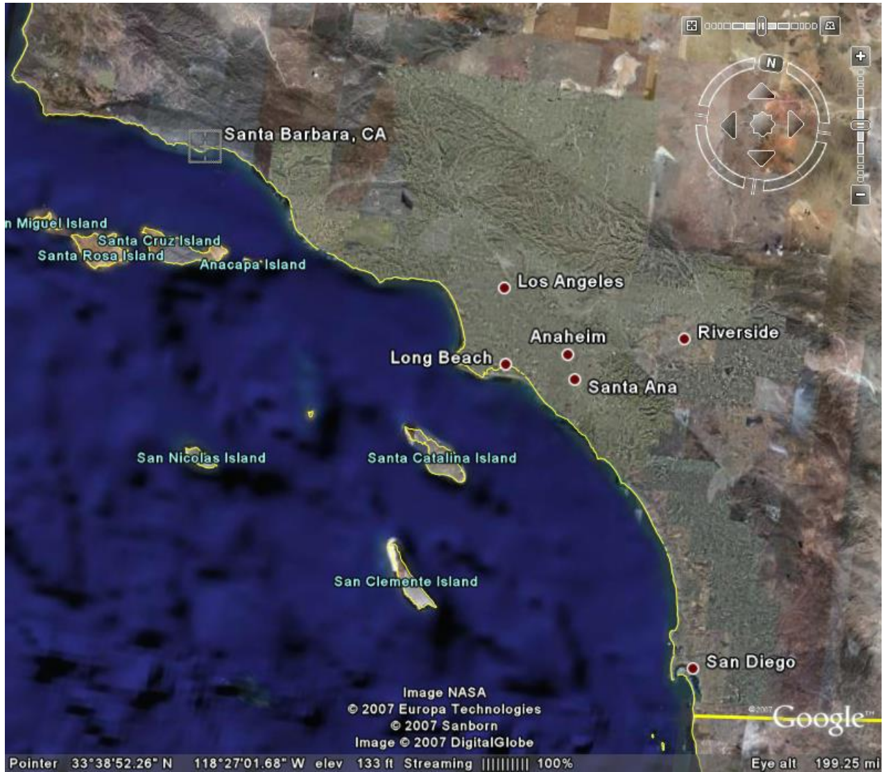
Figure 1: Google Earth image of Southern California Coast