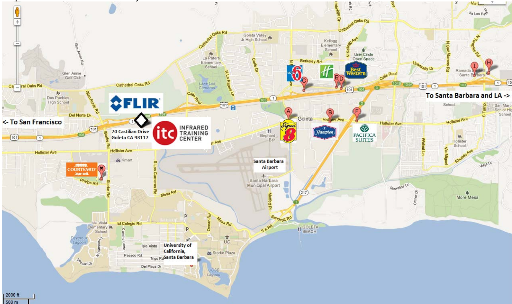
Map of Goleta with hotels nearby the FLIR ITC