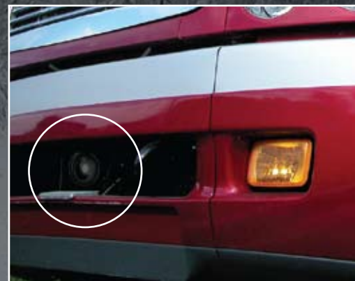
The PathFindIR installed behind the grill of a truck.