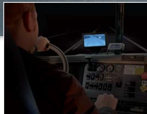
A monitor displaying the images of the PathFindIR, can be easily displayed on the dashboard. It quickly becomes a natural checkpoint for the driver similar to side view or rearview mirrors.