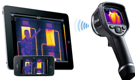
Wireless Connectivity to Smartphones, Tablets and more.

PORTLAND Corporate Headquarters FLIR Systems, Inc. 27700 SW Parkway Ave. Wilsonville, OR 97070 PH: +1 866.477.3687