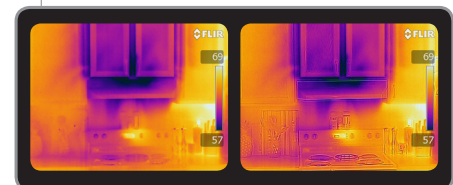
Original IR Image on the Left and with MSX ™ Enhancement on the Right image