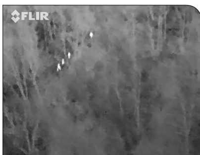
Find lost hikers or accident victims night and day.

Two kits are available so you'll be sure you to have the capability you need, when you need it.