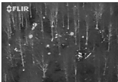
Assist mop-up crews by finding underground hot spots that could flare up.